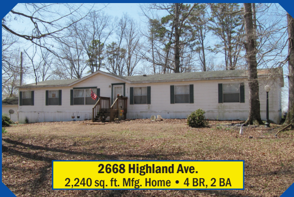
2668 Highland Ave. 2,240 sq. ft. Mfg. Home • 4 BR, 2 BA