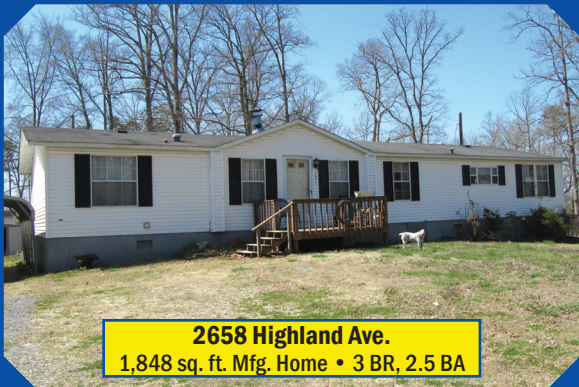
2658 Highland Ave. 1,848 sq. ft. Mfg. Home • 3 BR, 2.5 BA