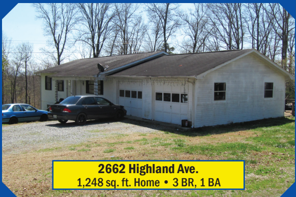
2662 Highland Ave. 1,248 sq. ft. Home • 3 BR, 1 BA