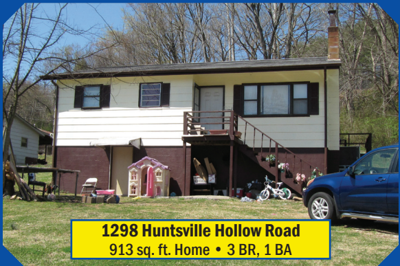
1298 Huntsville Hollow Road 913 sq. ft. Home • 3 BR, 1 BA

4 Rental Houses to be sold ABSOLUTE following 13 Tracts All homes have been recently or currently rented for $500-$550 per month